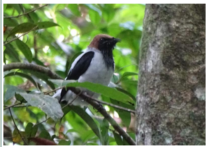
Bellbird

If six days spent at the world famous Asa Wright Centre, Trinidad, followed by four days at Blue Waters Inn, Tobago, sounds idyllic, then that's because it was! You could call it pretty much a birder's paradise. And even a must for serious, or not so serious, birders. We were lucky to have a great group of 14 who were all determined to have a good time and have fun together, as well as seeing loads of birds. Between us we clocked up 172 birds, many of them 'lifers'. The birding highlights included Cocoi Heron, Long-winged Harrier, Savanna Hawk, Aplomado Falcon, Blue-and-Yellow Macaw, Common Potoo, Green-backed, Guianan and Collared Trogon, Gray-throated Leaftosser, Bearded Bellbird, three species of manakin, Red-breasted Blackbird, Whiteheaded Marsh Tyrant and Red-billed Tropicbird. We also saw the island's only two endemics, the Piping Guan and the Trinidad Motmot.