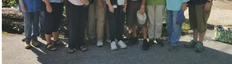
T&T group at the Asa Wright Nature Centre

If six days spent at the world famous Asa Wright Centre, Trinidad, followed by four days at Blue Waters Inn, Tobago, sounds idyllic, then that's because it was! You could call it pretty much a birder's paradise. And even a must for serious, or not so serious, birders. We were lucky to have a great group of 14 who were all determined to have a good time and have fun together, as well as seeing loads of birds. Between us we clocked up 172 birds, many of them 'lifers'. The birding highlights included Cocoli Heron, Long-winged Harrier, Savanna Hawk, Aplomado Falcon, Blue-and-Yellow Macaw, Common Potoo, Green-backed, Guianan and Collared Trogon, Gray-throated Leaf-tosser, Bearded Bellbird, three species of manakin, Red-breasted Blackbird, White-headed Marsh Tyrant and Red-billed Tropicbird. We also saw the island's only two endemics, the Piping Guan and the Trinidad Motmot.