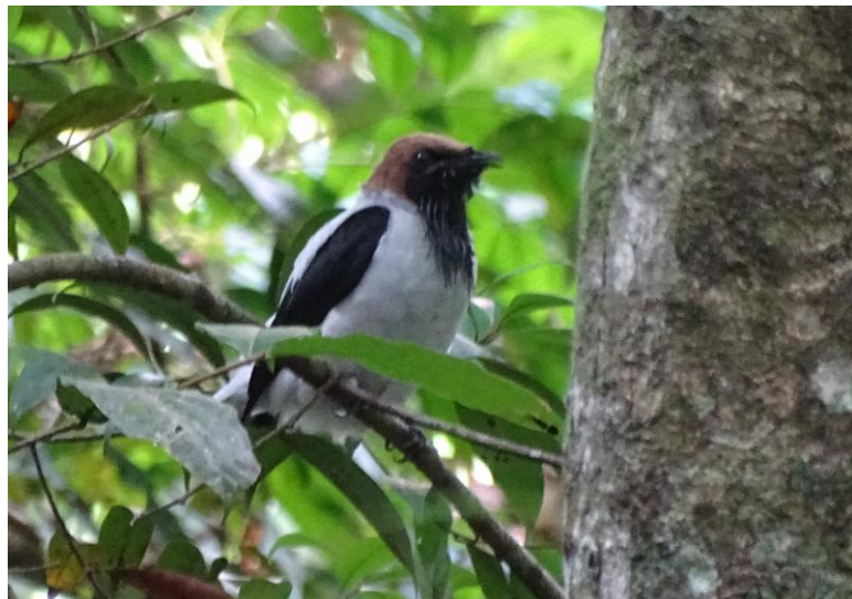
Bellbird

If six days spent at the world famous Asa Wright Centre, Trinidad, followed by four days at Blue Waters Inn, Tobago, sounds idyllic, then that's because it was! You could call it pretty much a birder's paradise. And even a must for serious, or not so serious, birders. We were lucky to have a great group of 14 who were all determined to have a good time and have fun together, as well as seeing loads of birds. Between us we clocked up 172 birds, many of them 'lifers'. The birding highlights included Cocoli Heron, Long-winged Harrier, Savanna Hawk, Aplomado Falcon, Blue-and-Yellow Macaw, Common Potoo, Green-backed, Guianan and Collared Trogon, Gray-throated Leaf-tosser, Bearded Bellbird, three species of manakin, Red-breasted Blackbird, White-headed Marsh Tyrant and Red-billed Tropicbird. We also saw the island's only two endemics, the Piping Guan and the Trinidad Motmot.