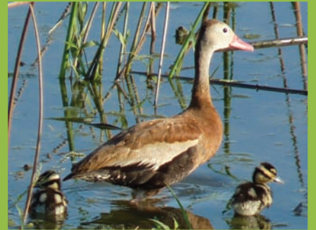
Black-bellied Whistling Duck