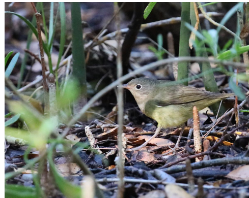
Connecticut Warbler at South Lido Park