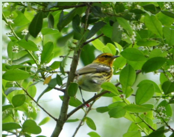
Cape May Warbler