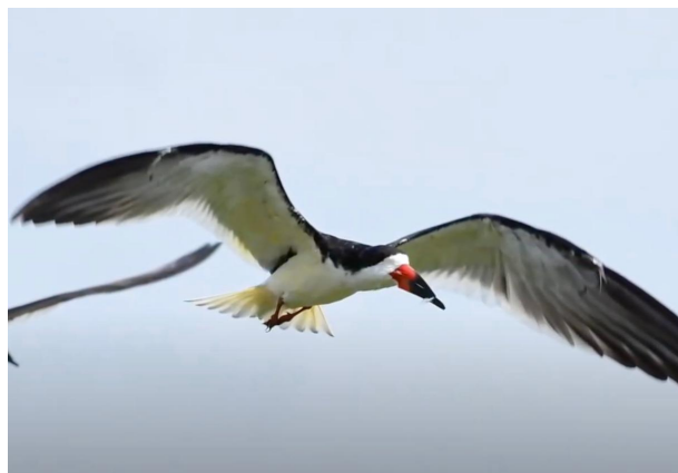
Black Skimmer with Fish