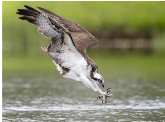
Osprey enters the water talons first