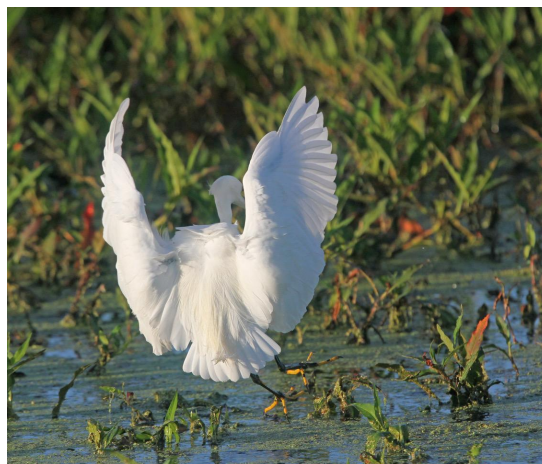
3. Who Am I?