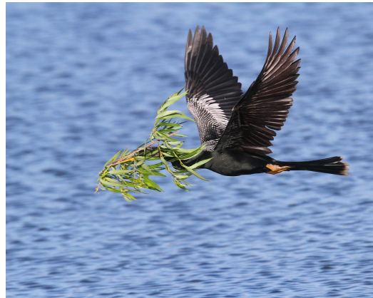
4. Who Am I?