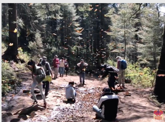
Screenshot from the Monarch Migration video.