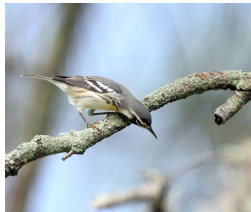
16.Who Am I?