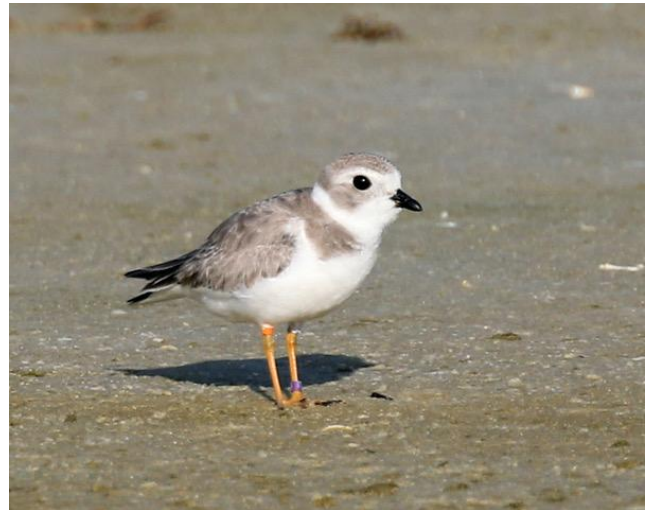
The Great Lakes Piping Plover called "Nish" that hatched this year in Chicago!