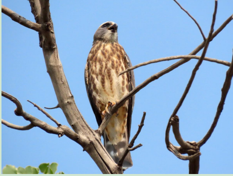
Mississippi Kite