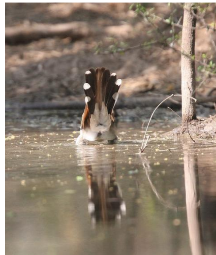
18. Who Am I?