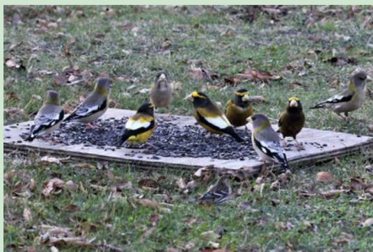
Evening Grosbeaks