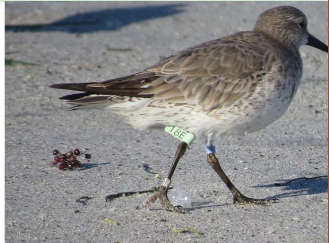
Red Knot, Palm Island, FL