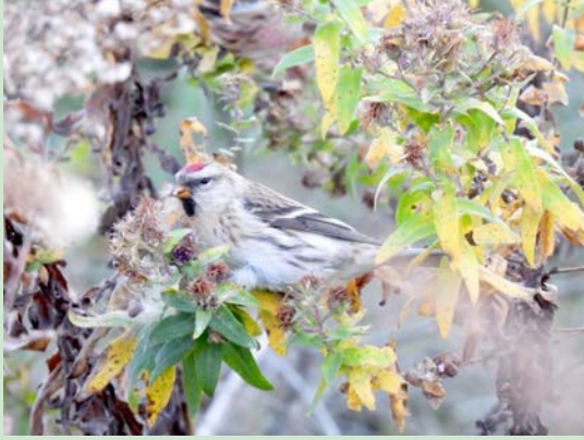
Hoary Redpoll

with drive southward representatives from all eight species: Pine Siskin, Common Redpoll, Hoary Redpoll, Purple Finch, Pine Grosbeak, Evening Grosbeak, Red Crossbill, and White-winged Crossbill. By mid-fall, a Common Redpoll had shown up in Albuquerque, New Mexico ; Evening Grosbeaks were spotted in the Florida Panhandle ; Pine Siskins headed out over the ocean to Bermuda ; and Hoary Redpolls visited Cleveland, Ohio . Learn more Here