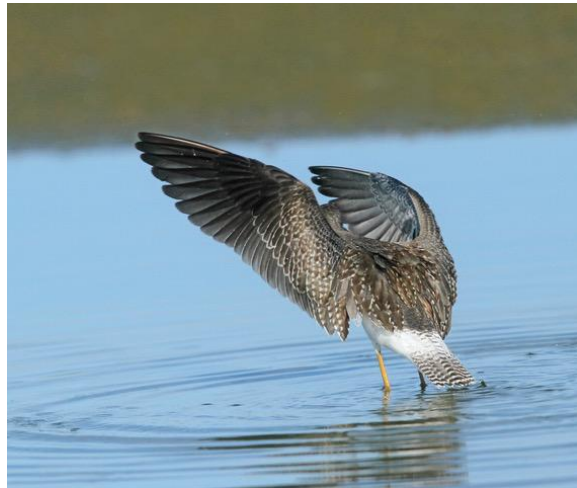
22. Who Am I?