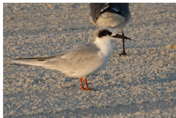
22. Who Am I?