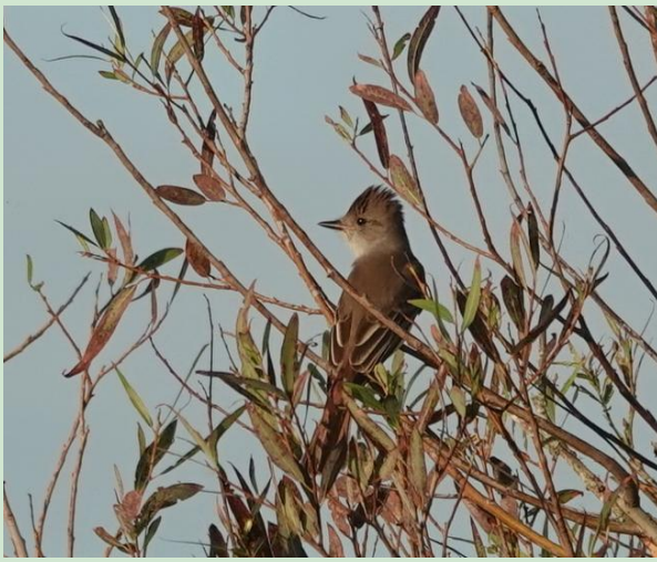
Ash-throated Flycatcher