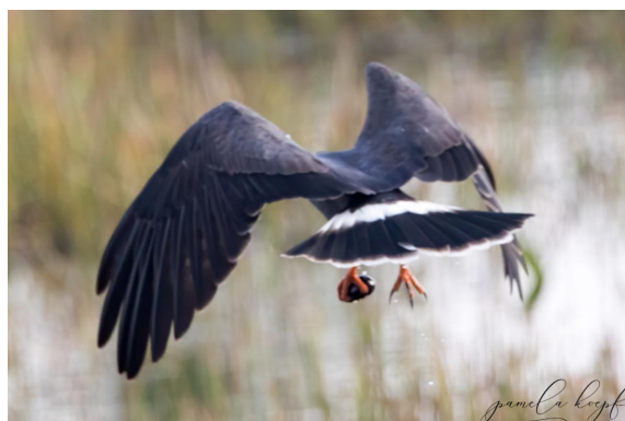
26. Who Am I?