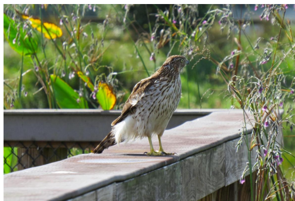
25. Who Am I?