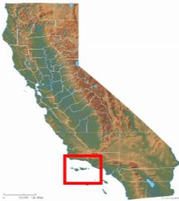
Channel Islands National Park