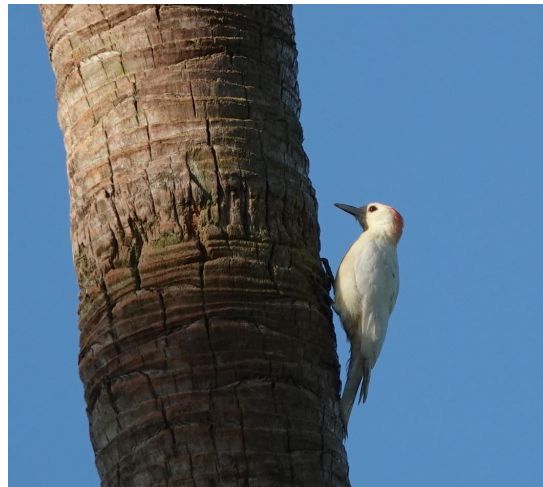
34. Who Am I?