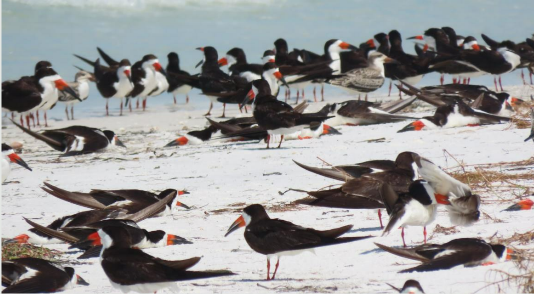
Cape Coral Burrowing Owls Pamela Koepf