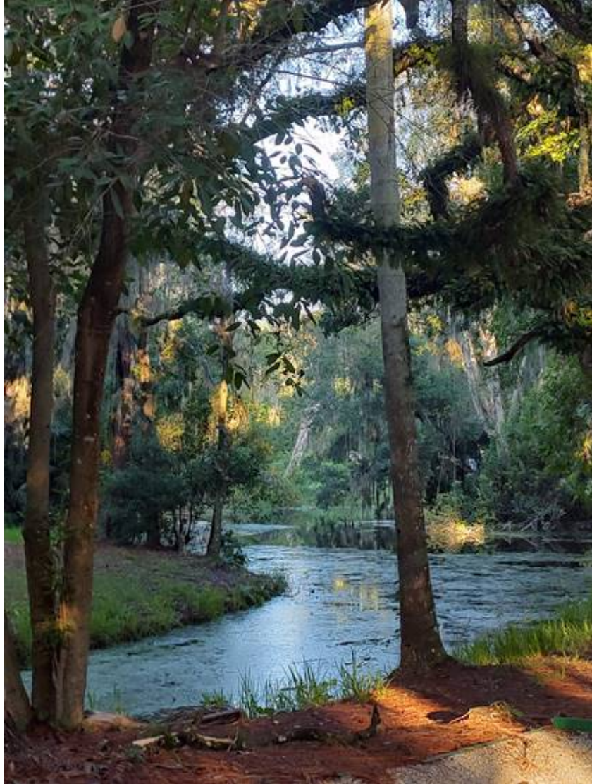
Lakeview Park

A hidden gem in Sarasota - Learn more here