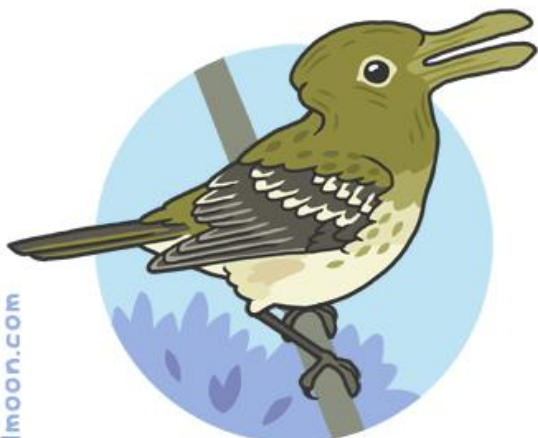
Duck or Rabbit