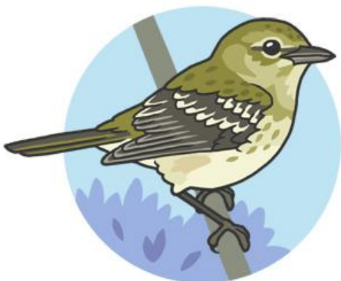
Bay-breasted or Blackpoll