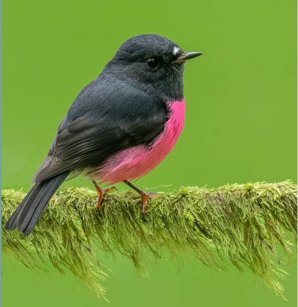
Pink Robin, Petroica rodinogaster