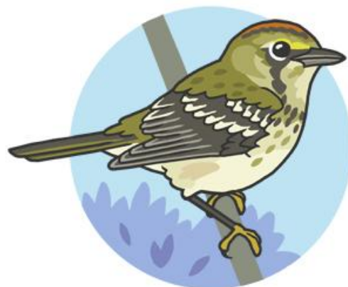
Bay-breasted or Blackpoll or Canada or Ovenbird