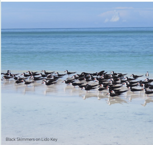
Black Skimmers on Lido Key

All ages welcome! No registration required. For more information: kylie.wilson@audubon.org .