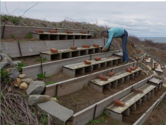
Tern Structures on Great Gull Island

FULL CIRCLE - The Great Gull Island Project 50 Years of Conservation with Director/Producer Anne Via McCollough