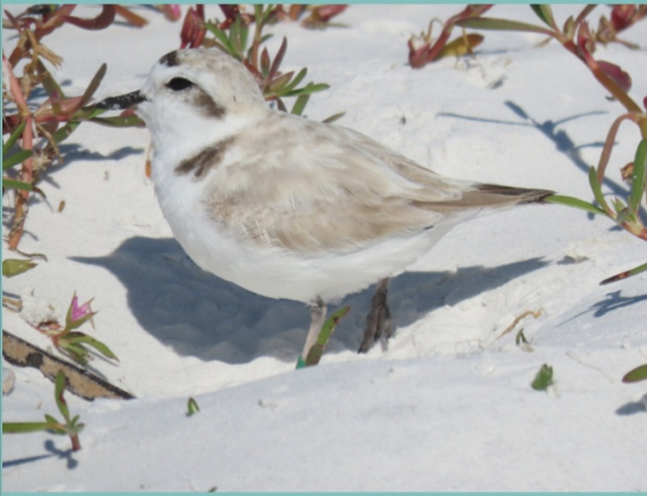
"Ms. Sanibel" the Snowy Plover on North Siesta Key