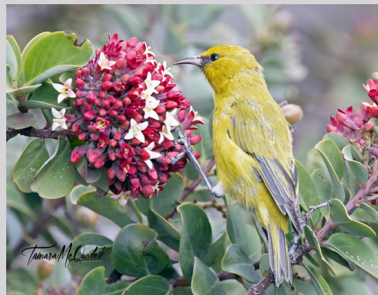
I'iwi on Maui