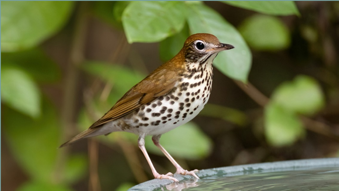
Wood Thrush

The Cornell Lab of Ornithology announced the release of a game-changing tool called eBird Trends in November. It is being touted as the most expansive and detailed set of visualizations ever produced to show the trends of bird populations.