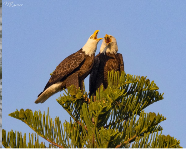
Left (Top) Yellow Cardinal Right (Bottom) Bald Eagle Pair