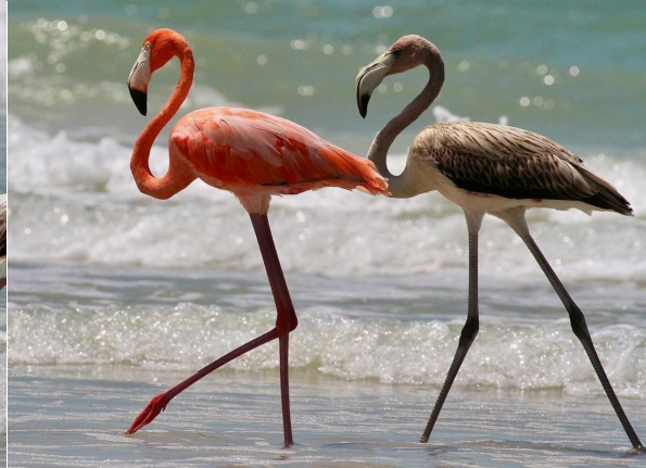
Above: Stephanie Olson

Flamingos migrating from Mexico were blown off-course and are showing up on Florida's Gulf Coast. These photos were taken at Treasure Island near St. Pete Beach by two photographers.