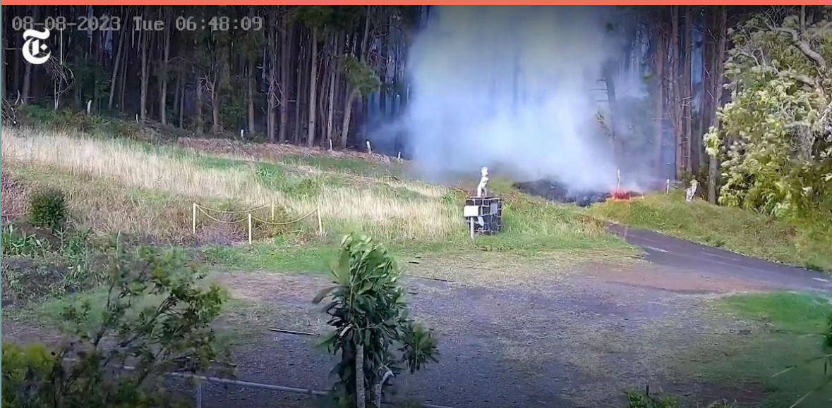
Wildfire and smoke at Maui Bird Conservation Center San Diego Zoo