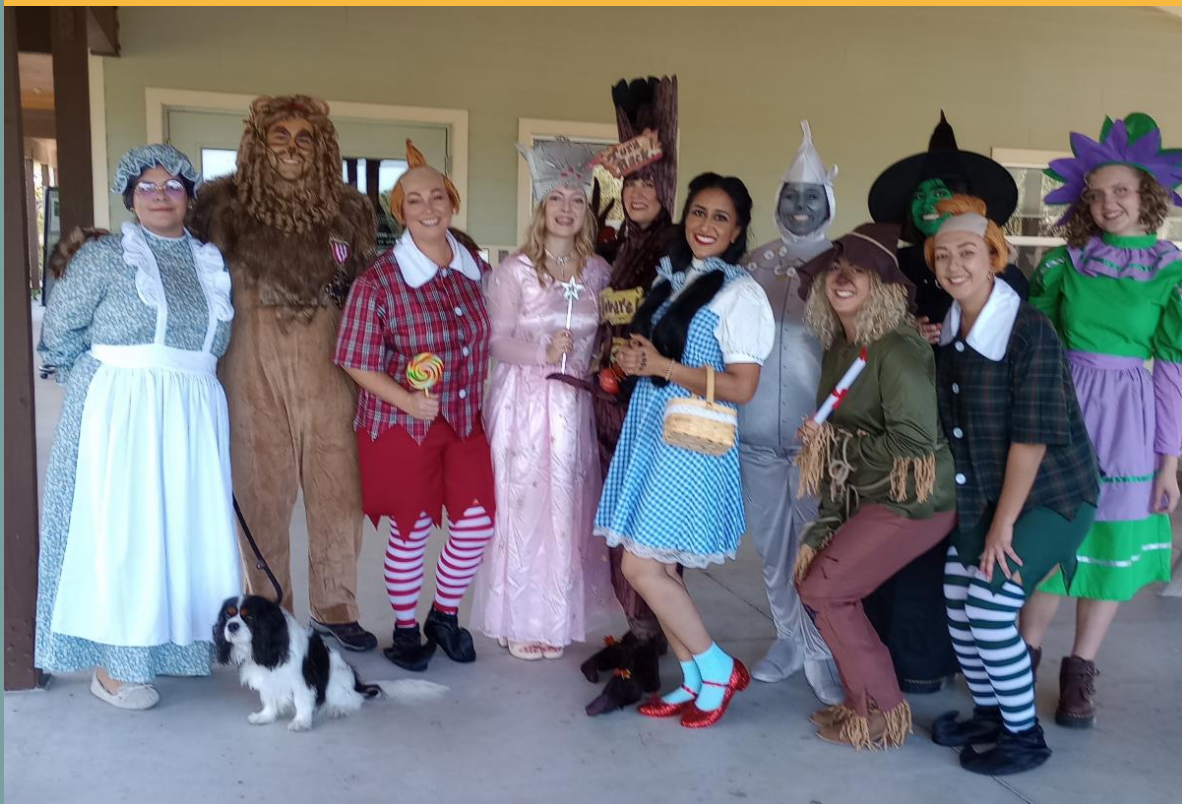
Above: Visitors from Oz at the Sarasota Audubon Nature Center

We're back! We opened our doors for the 2023-24 season on October 1, and we've already welcomed visitors from across the country and around the globe!