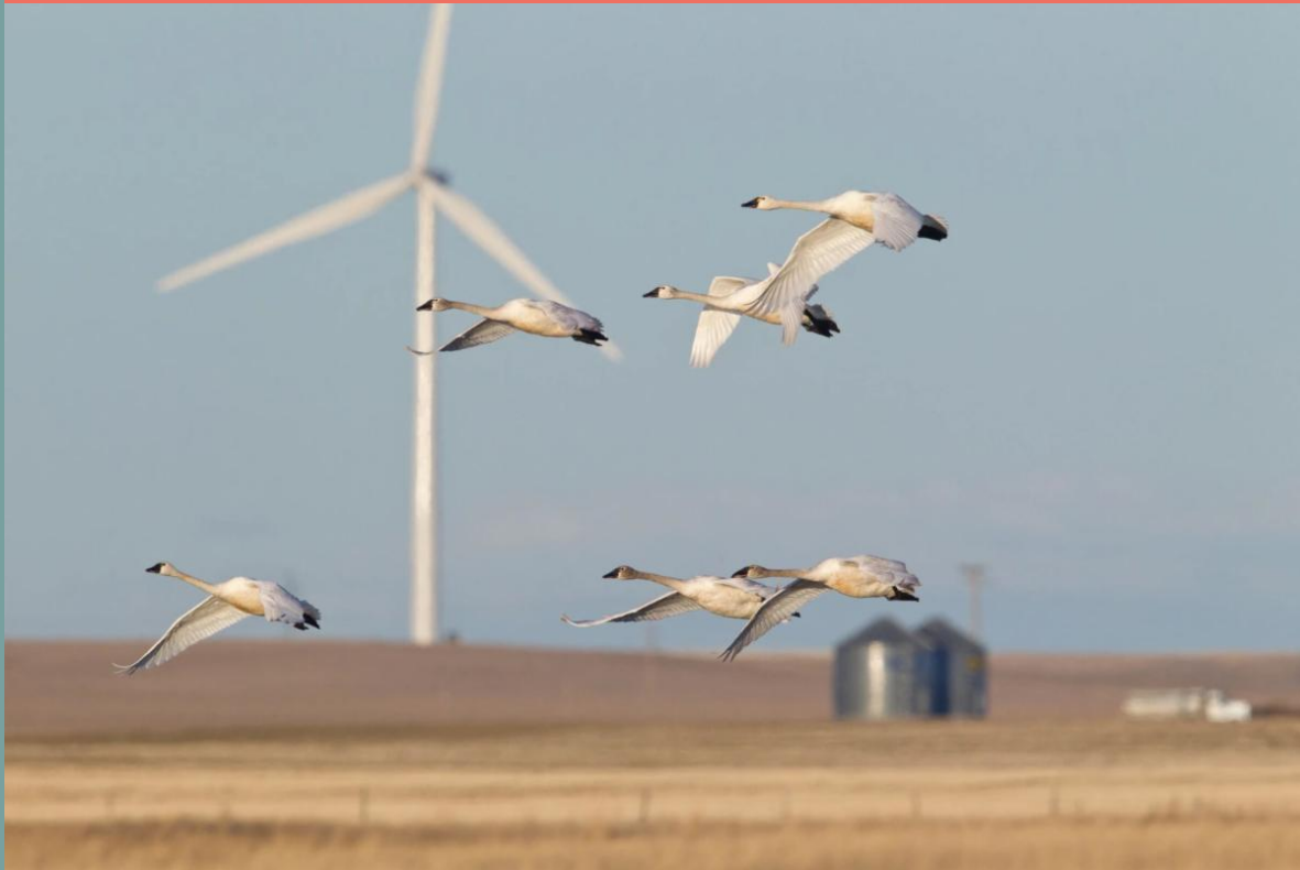
Tundra swans flying past wind turbines