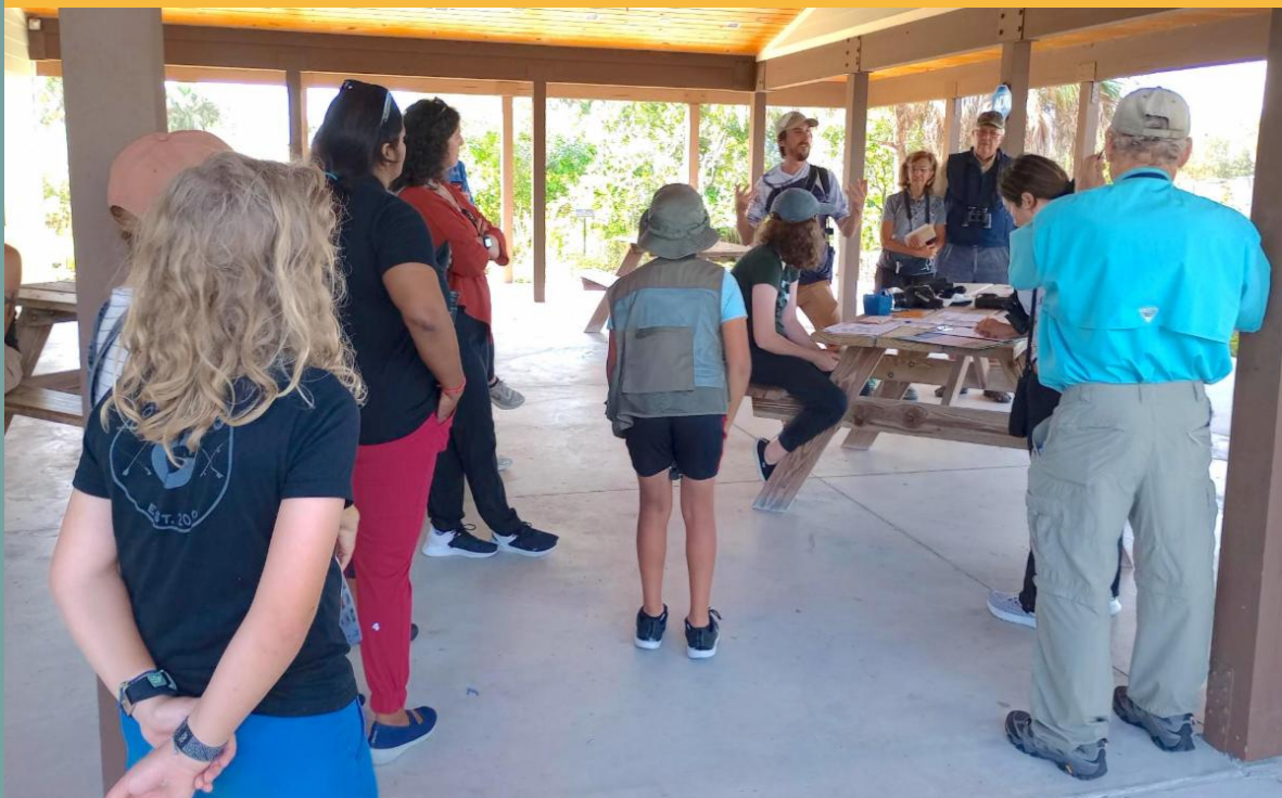
Above: Young Birders and chaperones at the Sarasota Audubon Nature Center

Lots happening at the Sarasota Audubon Nature Center, as you will see below. Talk of the Holiday Luncheon and lots of activities: Members-only Meet & Greet, Wingspan gaming, Young Birders Club, students from Ringling College of Art & Design choosing Sarasota Audubon for their nonprofit project and more -- read on!