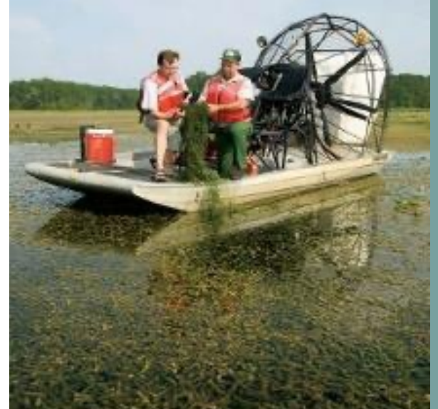
Left: Water hyacinth Right: Hydrilla on a Florida lake