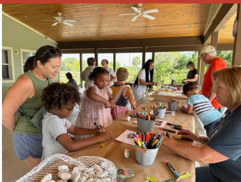
Budding Artists at the Nature Center