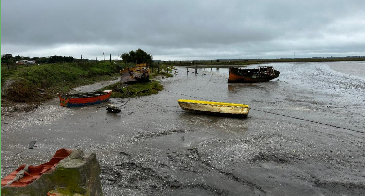
Above: The Estuary at Punta Rasa near Buenos Aires, Argentina