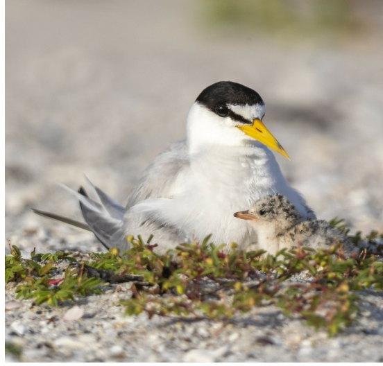
Left: Black Skimmers Right: Least Tern