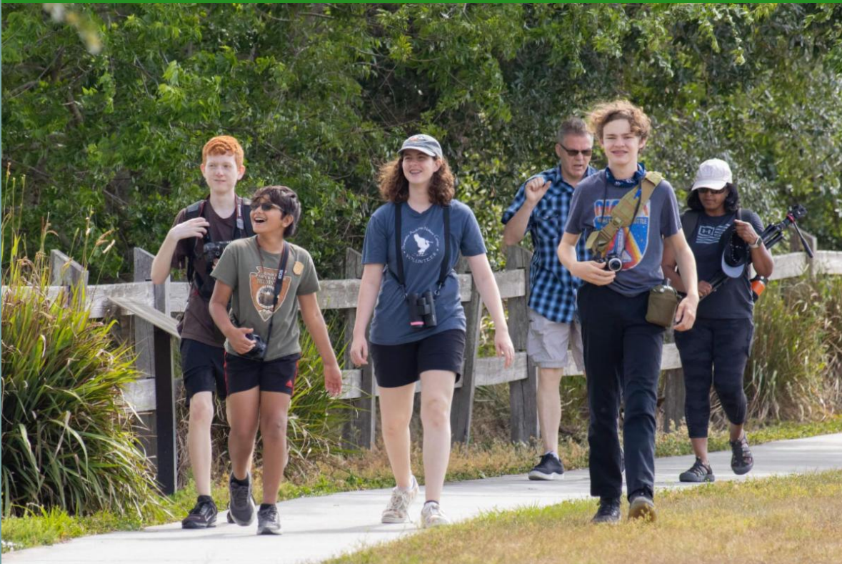
Above: Young Birders in Sarasota