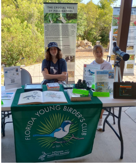
Florida Young Birder's Club