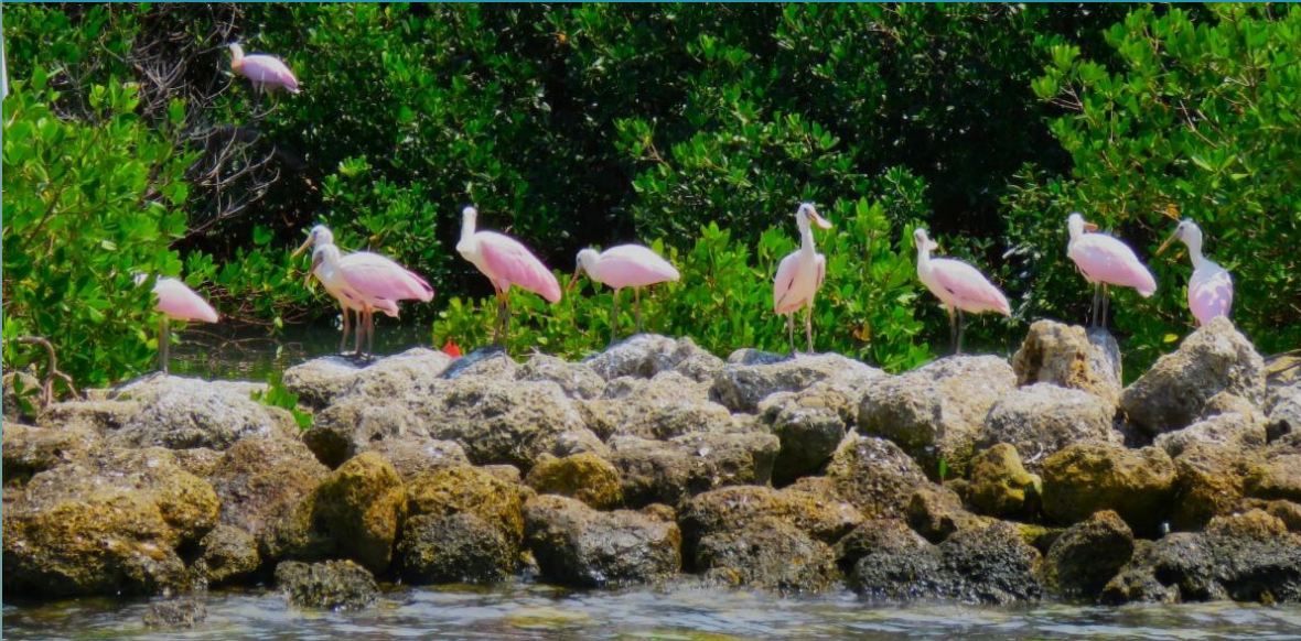
Roseate Spoonbills in Roberts Bay