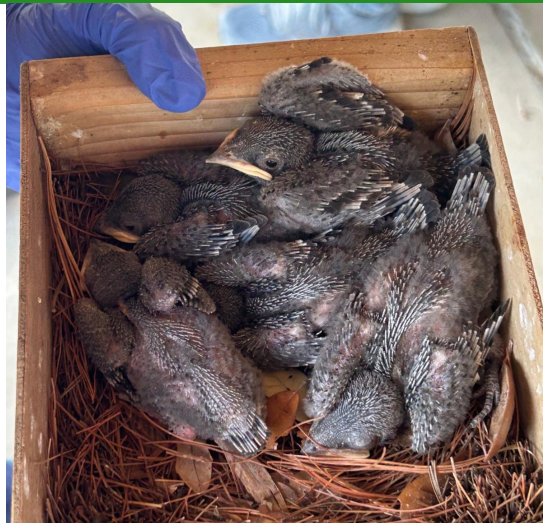
Purple Martin Hatchlings!

More than 250 people attended the Sarasota Audubon Earth Day event at the Nature Center. Native pollinator plants provided by Sweet Bay Nursery were sold by our board members; all plants were gone at the end of the day. The Purple Martin chicks were a huge hit! The Florida Young Birder's Club gained some attention, and young families created art.