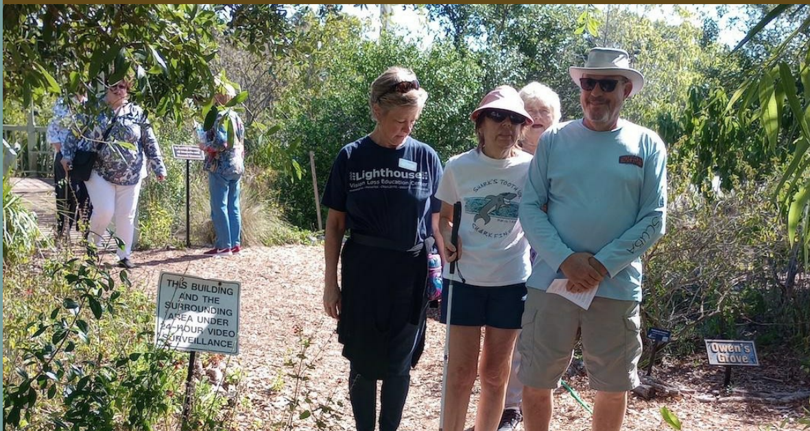
Above: "Lighthouse Vision Loss" Visitors at the Nature Center