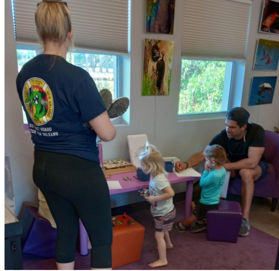
Young Families Create Art