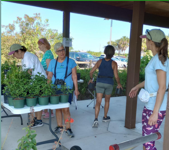
Native Pollinator Plant Sale