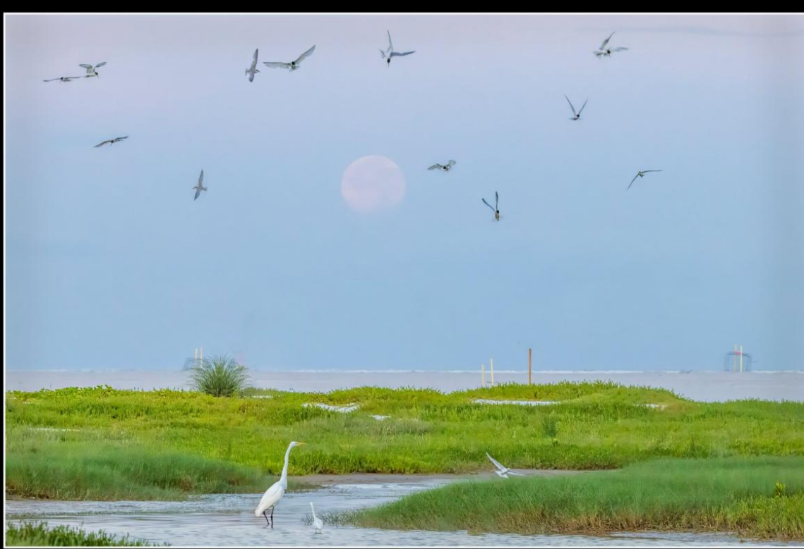
Above: The Estuary at Punta Rasa near Buenos Aires, Argentina

I went to South Lido Beach exceptionally early on Saturday, June 22, 2024, so I could photograph the setting moon over the Gulf of Mexico with a tidal pool and the beach in the foreground. The setting moon was disappointing, but boy, the morning was far from disappointing. The Least Terns were having a feeding frenzy in the tidal pool, where a school of small bait fish had been trapped by the outgoing tide.