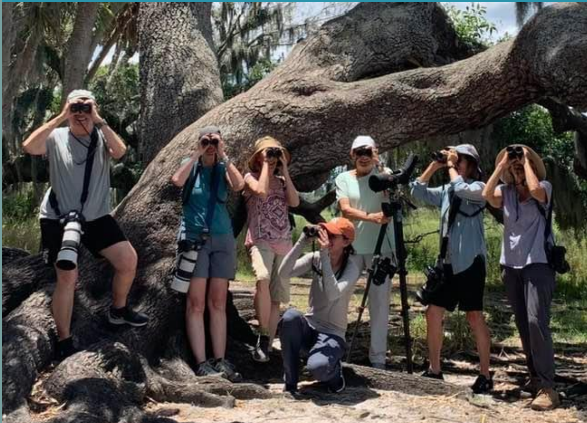
Sarasota Audubon Birders at Myakka River State Park