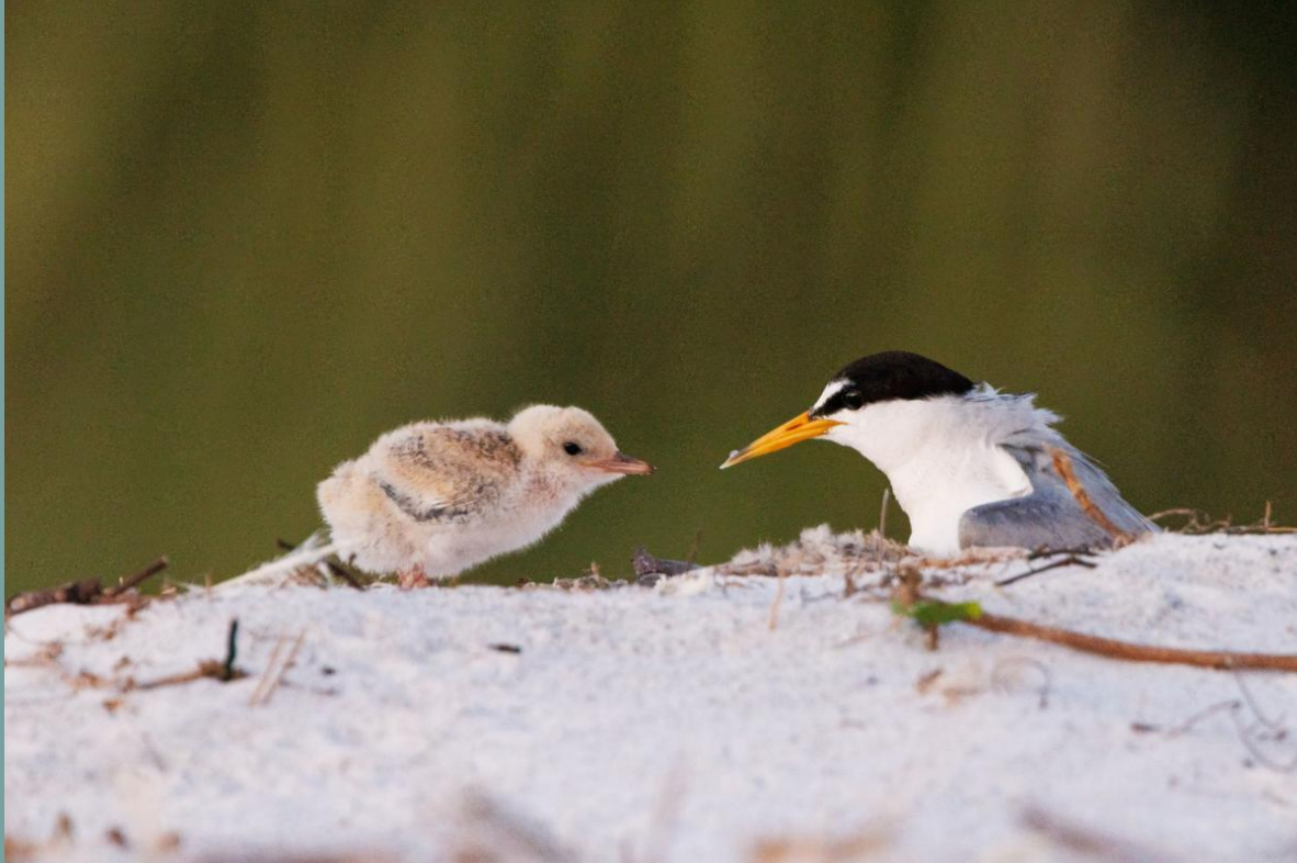
Above: Least Tern chick on Longboat