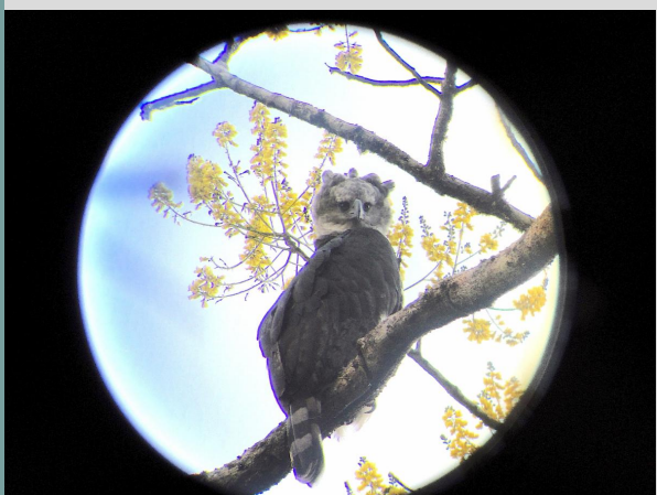
Above: Harpy Eagle Harpia harpyja through a spotting