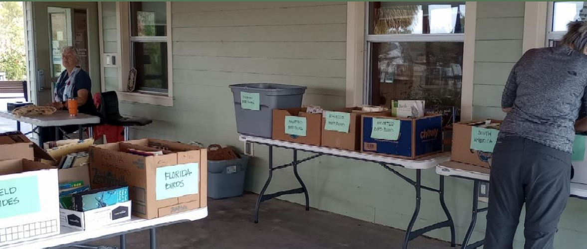
Above: Volunteers at the Patio Sale at the Nature Center in January

It's been a chilly winter at the Sarasota Audubon Society's Nature Center, but hundreds of friendly faces passing through our doors have helped keep us warm. This year, we have plenty of fun, exciting events planned, and we hope you'll join us. First, check out the activity calendar on our website , and make sure you sign up for events that require pre-registration. There's something for everyone on tap at Sarasota Audubon in 2025.