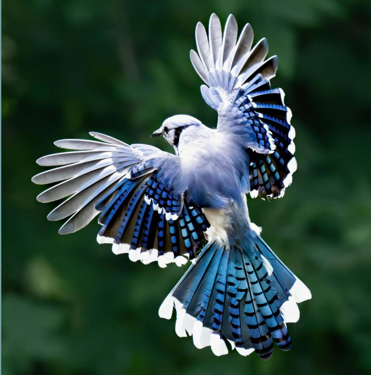
Above: Blue Jay, a common summer bird sighting Allan Woolway

It sure is quiet around here with the visitors and volunteers and migratory birds gone. Sure, summer's a great time to get some projects done around the house and enjoy a free sauna, courtesy of extreme Florida heat and humidity, but seriously, who are you supposed to talk to? Not to worry; you can still socialize at the Celery Fields!