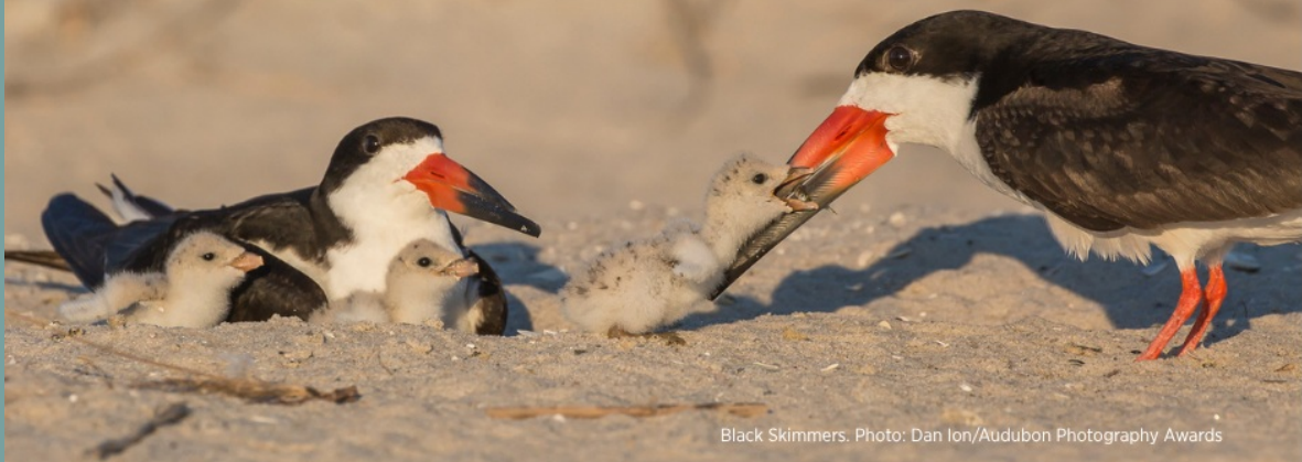
Black Skimmers.

Email Evan Powers to sign up evan.powers@audubon.org