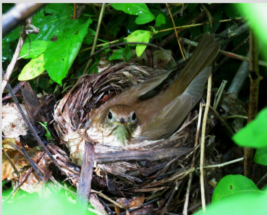
Veery on nest